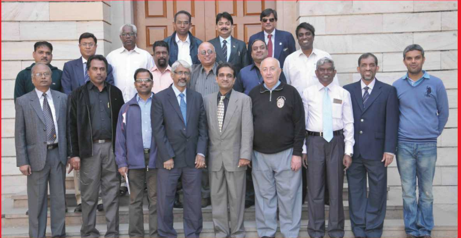
Group Photograph of the participants at the GC meeting at Jaipur